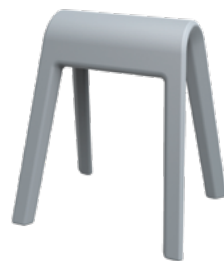
204/03 Gray Sitzbock