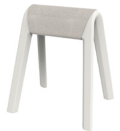
204/02 Sitzbock with saddle blanket

Further information at: www.wilkhahn.com