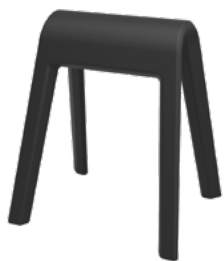
204/01 Black Sitzbock

Even stacked at right angles, the Sitzbock pommel horse seats are eye-catchers that invite people to stop and talk to each other.