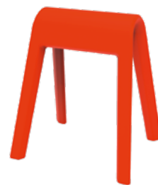
204/04 Orange-red Sitzbock