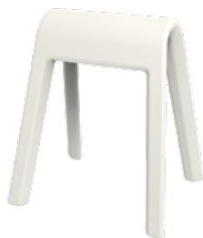
204/02 White Sitzbock